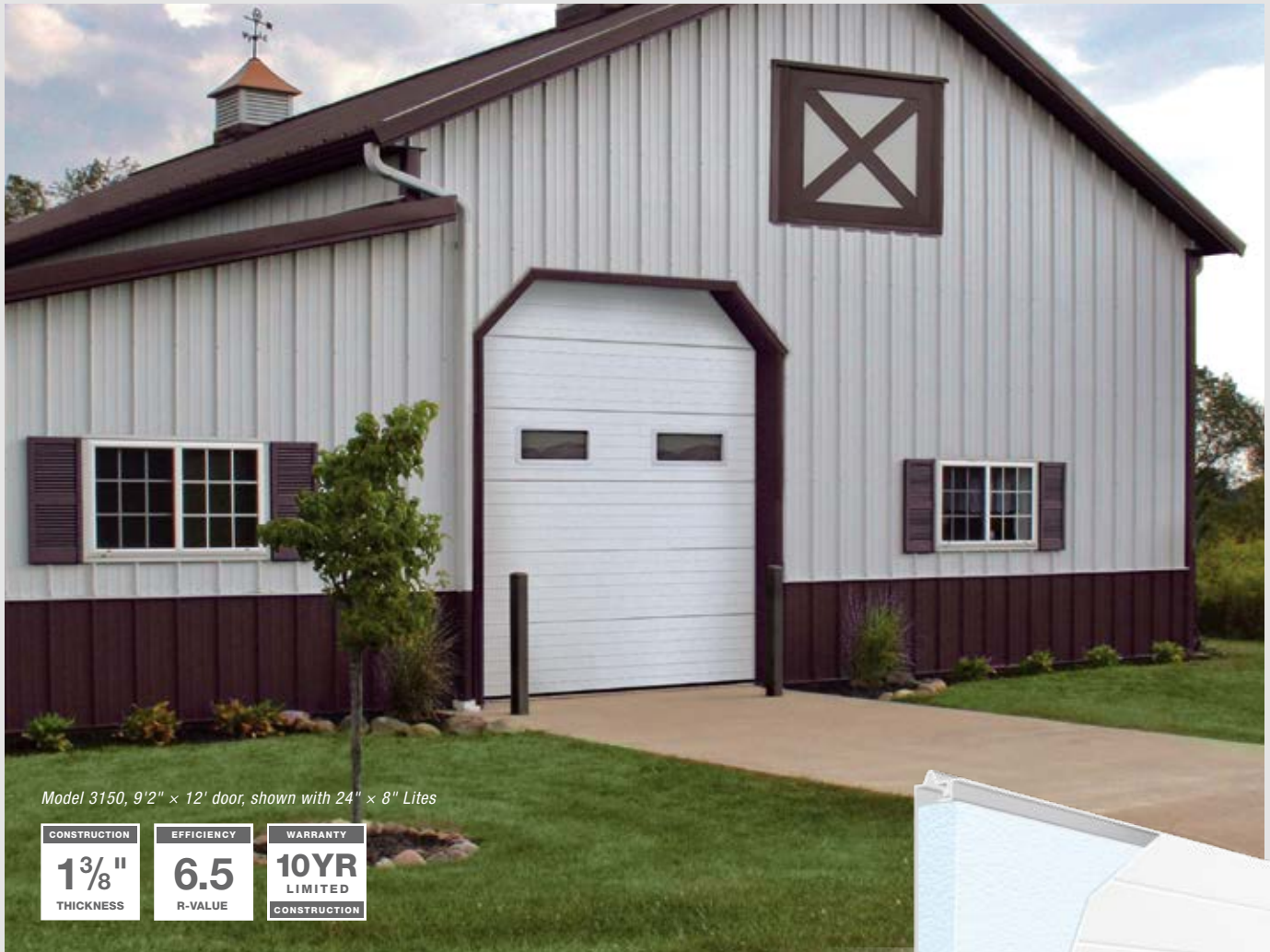
Model 3150, 9'2" x 12' door, shown with 24" x 8" Lites