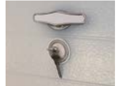
Outside keyed lock