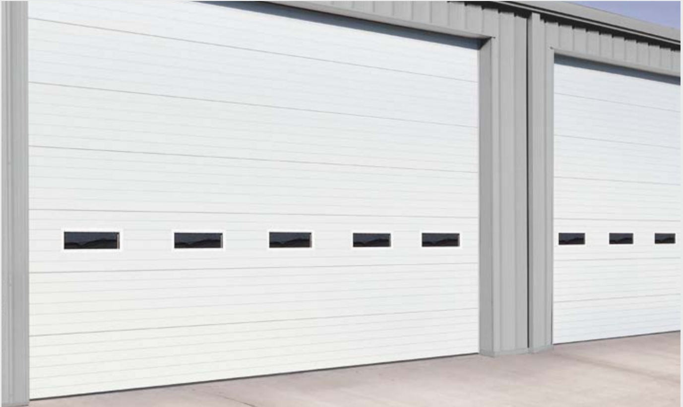
Model 3717, 16'2" x 14' doors, shown with 24" x 8" Lites