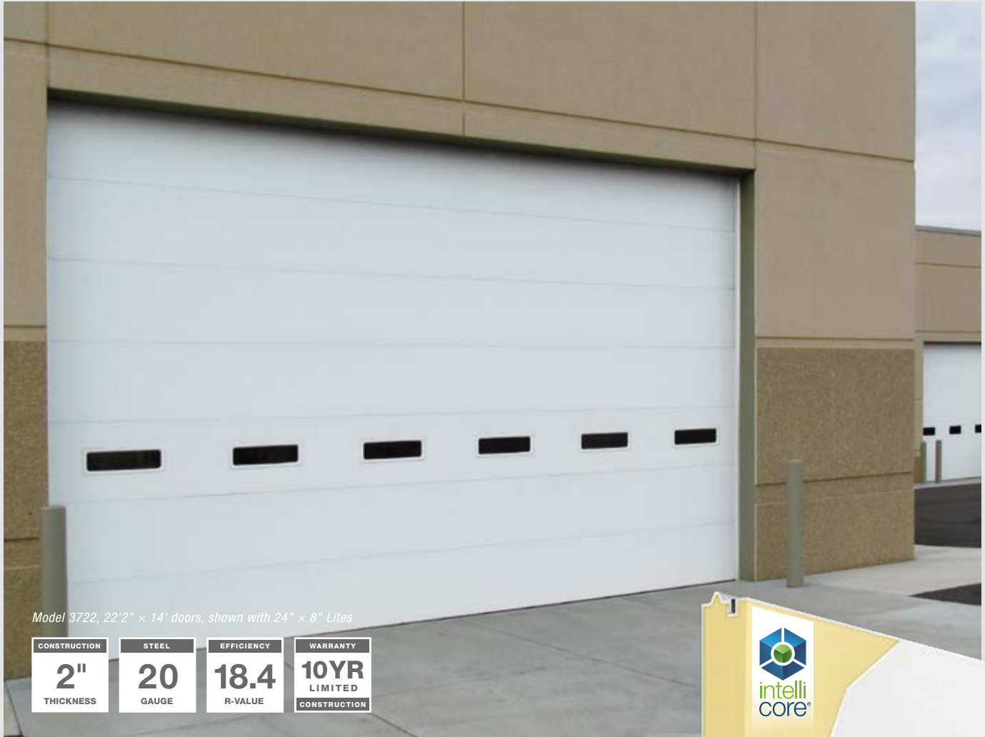
Model 3722, 22'2" x 14' doors, shown with 24" x 8" Lites